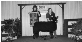
Champion Natural Colored Ewe