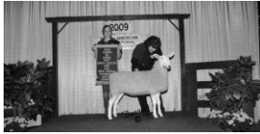
Champion White Ewe & Best Head Ewe