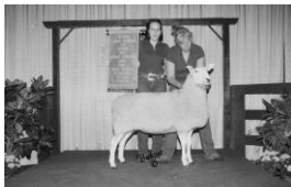
Reserve Champion White Ewe