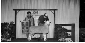
Champion White Ram