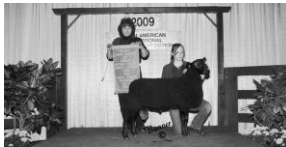
Reserve Champion NC Ram