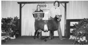
Champion Natural Colored Ram & NC Best Fleece