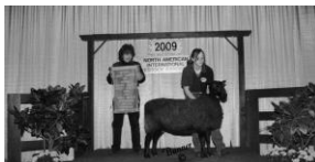
Reserve Champion NC Ewe