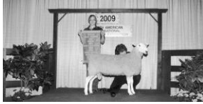
Reserve Champion White Ram